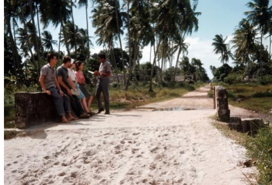
Bridge between Pontezinha and Ponte dos Carvalhos (6)