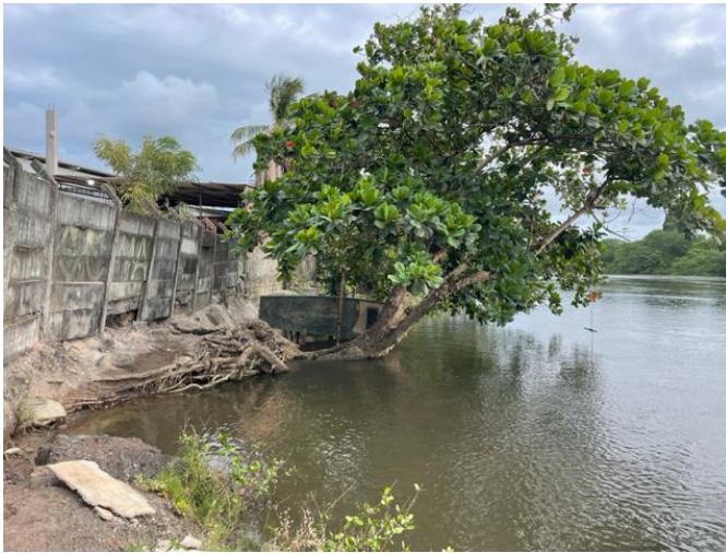
Walk to the only part of the river accessible now. (18)