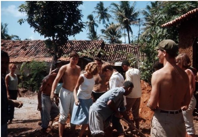
Group working on adobe (9)