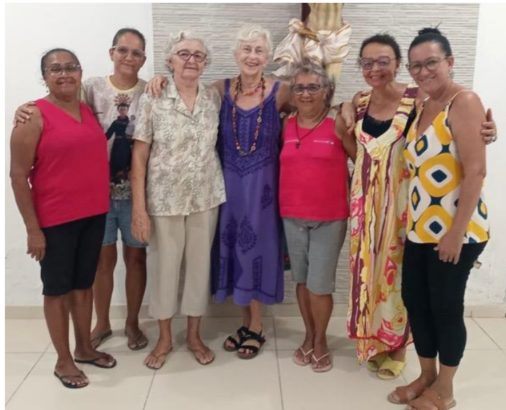
Women in Pontezinha who helped me understand their community (17)

It was from these women that I learned what had transpired in Pontezinha.