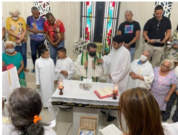
Chapel showing exterior, 1965 (12) Chapel interior, 2022

Santo Antônio da Barra Chapel, in Pontezinha (left outside, and the altar on right) --- The facade has since been covered with a galpão which destroyed its beauty.