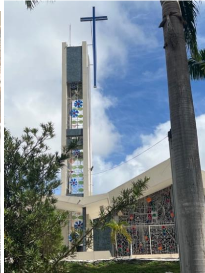
View of Church of Nossa Senhora do Bom Conselho (32)

Later, in a backlash against liberation theology, the Catholic church moved into a more conservative phase—a new Archbishop was named for Recife and Olinda and new priests were sent to Pontezinha and P dos C.