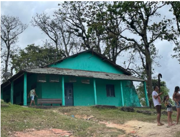
Casa Grande –the factory owner’s home and land (21)

Another afternoon we spent walking around the “Casa Grande” the large house where the factory owner lived and the huge surrounding estate, which has been left unused since the factory closed.