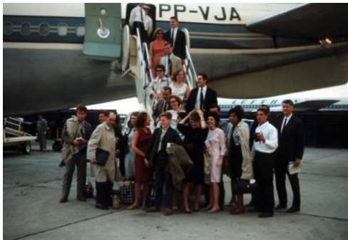
Group arrival in Recife, 1965 (1)