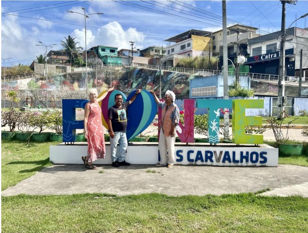
Ponte dos Carvalhos (15)