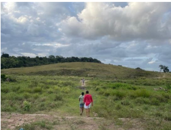
The property of the Casa Grande (22)