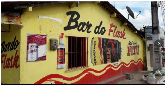
Bar Flash