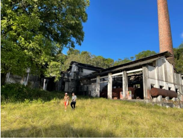
Site of abandoned gunpowder factory (20)

Another afternoon we spent walking around the “Casa Grande” the large house where the factory owner lived and the huge surrounding estate, which has been left unused since the factory closed.