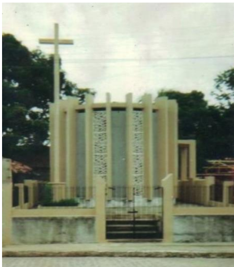
Mass celebrating 75 years (13)

In Escada, a neighbor city, the reports are also numerous. The parish house, for example, was next to the city police station. When new prisoners arrived and they were subjected to torture sessions, they did not hesitate to shout for Padre Geraldo. Geraldo didn't think twice: he ran to the police station and immediately stopped the torture of those men (FONSECA, 2000).