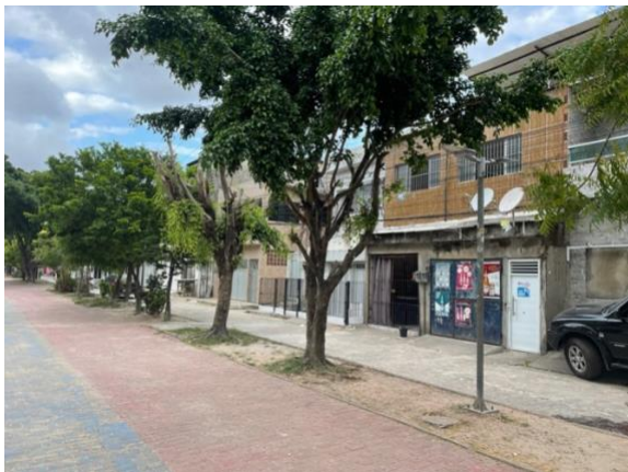
Side street in Pontezinha (29)

The contrast with the following wide commercial boulevard, filled with people, stalls, shops and stores of all kinds in Ponte dos Carvalhos.