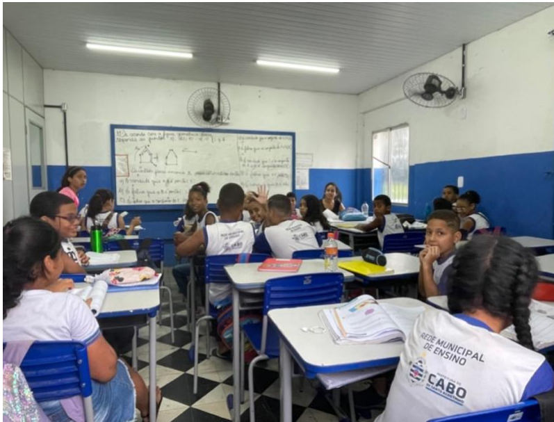
Children at school in Pontezinha (37)

In that same year, the SUS—Unified Health System --was established, reaching communities across Brazil, including P and PdC. It even came to the Quilombos