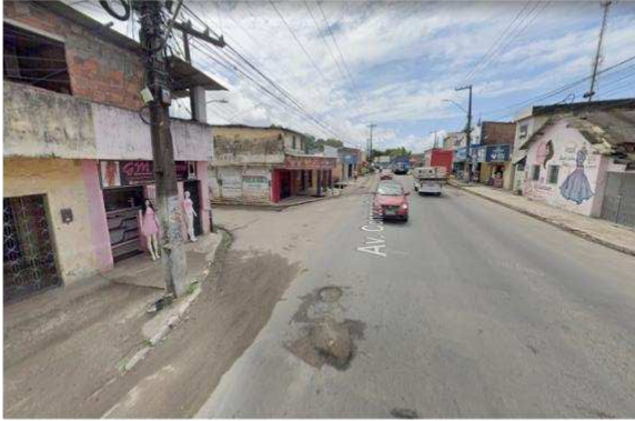
Google maps, Pontezinha. (28)

Ponte dos Carvalhos has always been the larger and more prosperous of the 2 villages. The photos below show the comparison. The first is a shot of Pontezinha's main road.